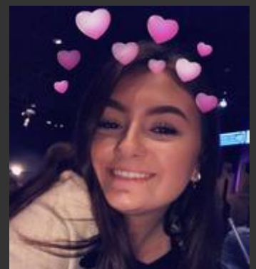
SELF ADVOCACY (not pictured) -Anthony Roedel-